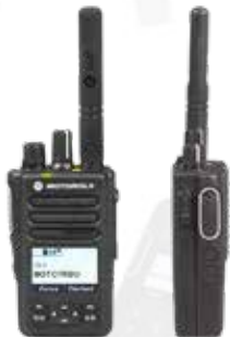
Motorola Solutions DP3661e

With a fleet in excess of 18,000 handsets if there's one thing we'll be sure of is that we will have the right handset for you.