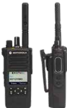
Motorola Solutions DP4600