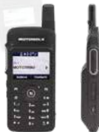
Motorola Solutions SL4000