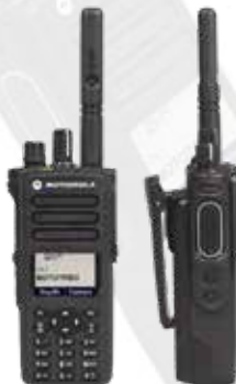
Motorola Solutions DP4800