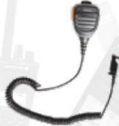
Remote Speaker Mic